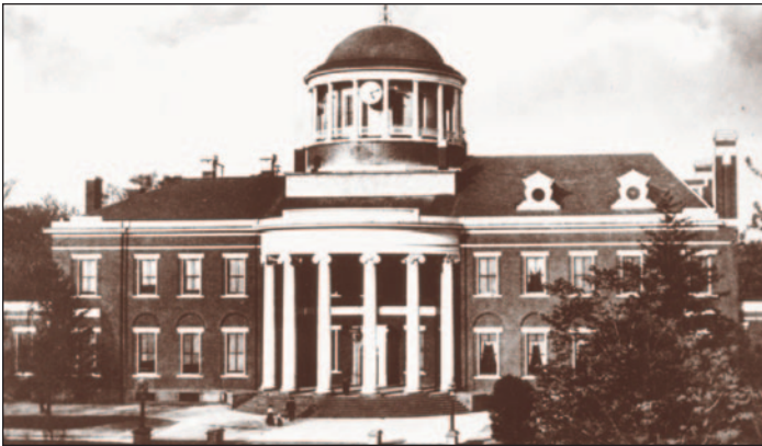
Harrisburg has been the capital of Pennsylvania since 1812. The main building of the original Capitol, pictured here, was destroyed by fire in 1897.